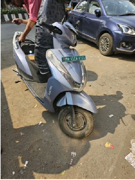
Vehicle Received Photos

**Carry this slip at the time of delivery. Vehicle will be delivered only after full payment and submission of this slip**